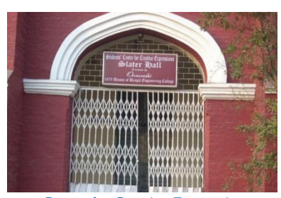
Centre for Creative Expressions