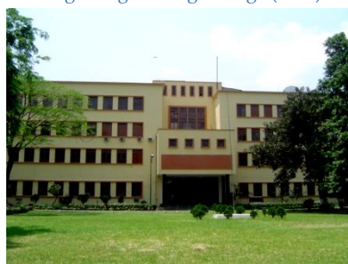
Main Academic Building