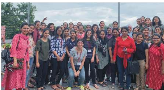
On Ongoing Site by Shristi Interiors located Bangur Avenue