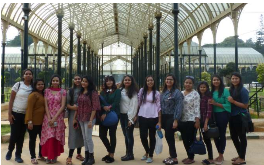
Lalbagh Glass house