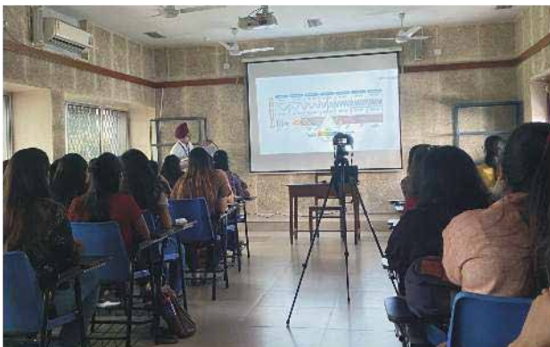
Lecture on Lighting