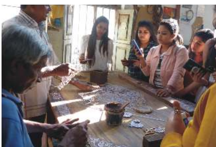
Majeed Fine Arts