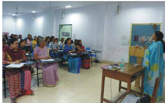
Lecture on Feng Shui