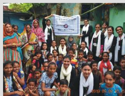
Social Activity (through NSS)