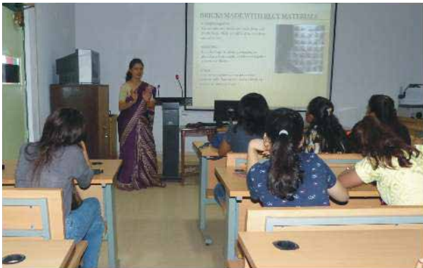
Lecture on Unconventional Building Materials