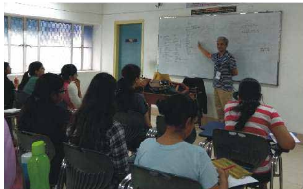
Lecture on Product Analysis