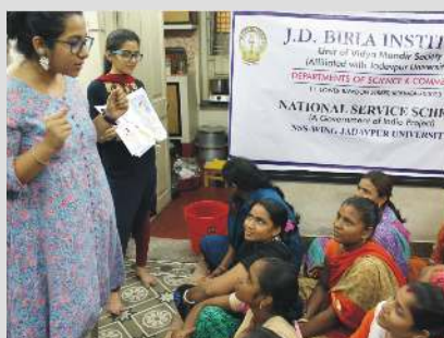
Social Activity (through NSS)