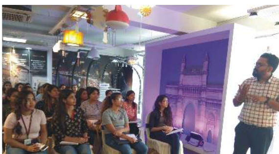
Philips Light Lounge