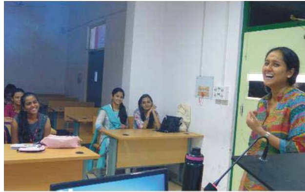
Lecture on Beautiful Home Techniques