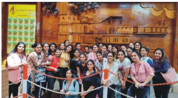
Green Ply Industries Ltd.