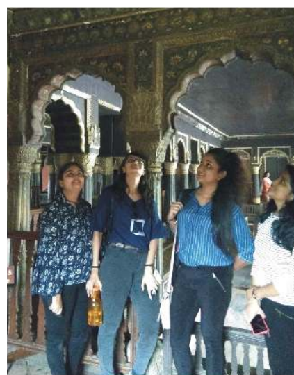
Tipu Sultan's Summer Palace