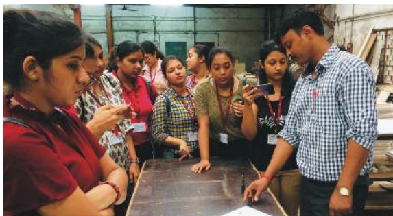
Duroplast Furnitur Systems Pvt. Ltd.

Field visits to factories and industries are conducted to provide practical exposure and enable students to relate classroom teaching with real life situations