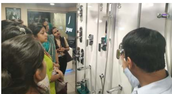
Jaquar Orientation Centre