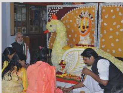
Basant Panchami Celebration