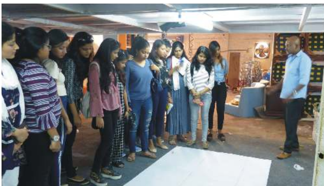
Mayuri International Furniture Manufacturer