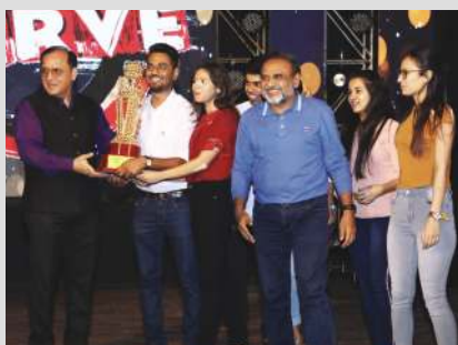
Verve (an Inter-college fest)