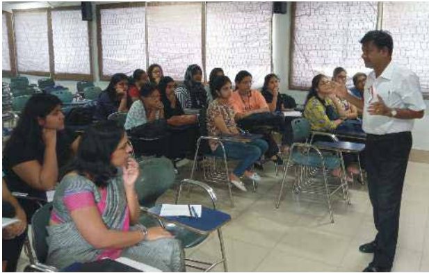
Lecture on Air Conditioning: An Overview