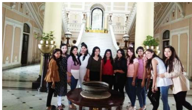
Lalitha Mahal Hotel