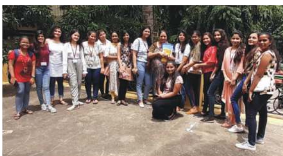
Vijay Manzil, Burdwan Rajbari