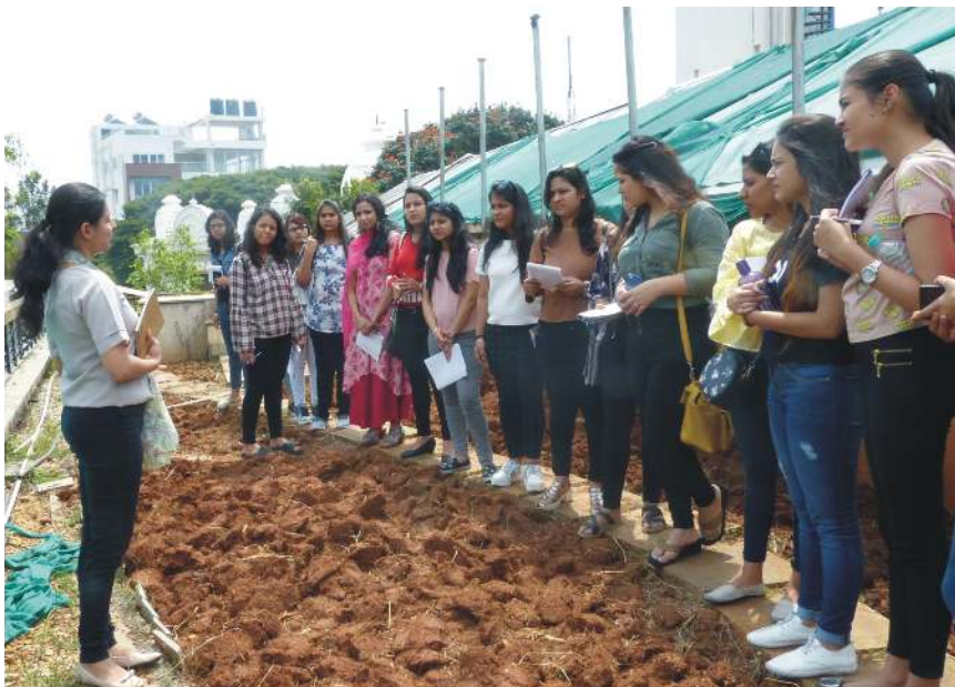
The Energy & Resources Institute