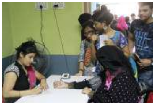
Health Check Up Programme Organized by NSS Unit Maulana Azad College, 2019

Maulana Azad College has a heritage of publishing a Students Magazine, peer-reviewed but an editorial board of Faculty members. All the Departments also maintain Wall Magazines within the College premises where students regularly update their creative inputs relevant to their field of study.