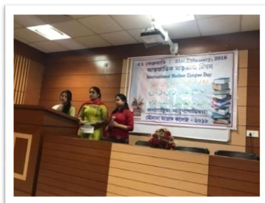
Celebration of Antarjatik Matri Bhasa Dibas