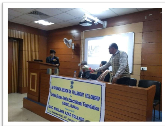
Outreach Session on FulBright Fellowship-USIEF, Kolkata-Organised by IQAC-Maulana

The College encourages the Departments to organize seminars, conferences and Invited Lectures on relevant themes during each academic session. The Departments also collaborate with each other to conduct seminars on relevant themes, with the active participation and volunteering of the students. Special students' seminars are also held by different Departments and also form a part of the continuous evaluation of the students' progress and their orientation to research activities.