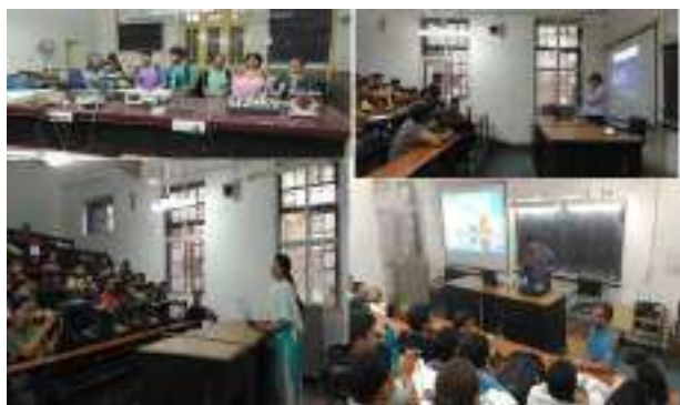
Peer Meet & Hands-on-Training-DBT Star College Programme by Physics