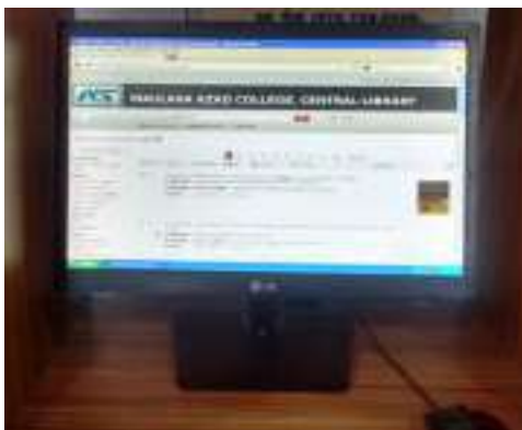
Online Public Access Catalogue

The Library of Maulana Azad College possesses approximately 1,00,000 books, including a huge number of rare books, Manuscripts, Reference books like dictionaries, thesaurus, and encyclopaedias etc.