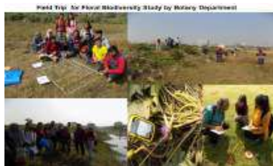
Field Trip by Botany