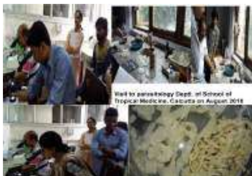
Peer Meet & Field Trip under DBT Star College Program-PG Department of Zoology