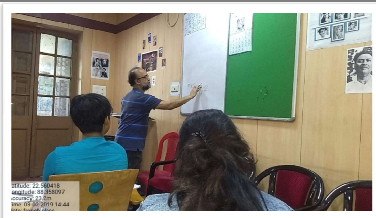
French Learning Course- by Post Graduate Department of English

The College pledges to generate awareness among the students and teachers on contemporary issues. In recent times, the College has organized programs to create awareness on subjects such as health, environment, gender sensitization and cultural harmony. Such programs are often conducted under the aegis of the NSS unit, and in collaboration with NGOs.