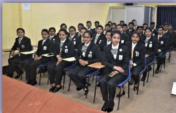
B. VOC Students in their Class Room

The Department of B.Voc in Tourism and Hotel Management in Serampore College is affiliated to the University of Calcutta and is sponsored by UGC and THSC. The Department is pledged to train promising men and women in hospitality and tourism sectors. Practical presentation remains a significant aspect of the technical training given to the students.