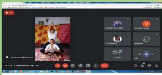
OBSERVANCE OF YOGA DAY