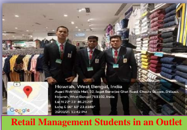
Retail Management Students in an Outlet

The Department has all modern facilities like Air Conditioned Smart Classrooms and computer laboratories for practical training. This Department organizes various kinds of seminars, webinars and workshops related to the hospitality and tourism sectors from time to time. The students get the opportunity to train and equip themselves with the necessary knowledge and skill. On-the-Job training is a part of their