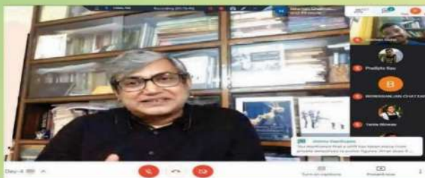
WEBINAR BY DEPT OF ENGLISH