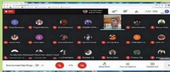
OBSERVANCE OF ENVIRONMENT DAY