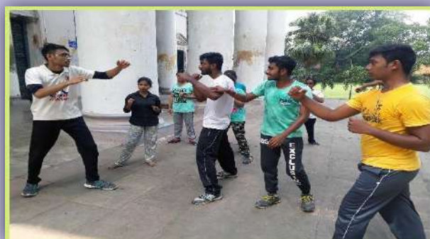
Students undergoing Self-Defense Training

Serampore College has introduced Self-defense Training Programme on 21st August, 2019. Savate Association of West Bengal conducts this Self-Defense Training Programme on every Wednesday from 9 a.m. to 10 a.m. This is a one-year course. In this unique training programme, different techniques are learnt and practised by the students, under the