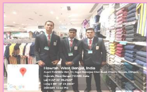
Retail Management Students in an Outlet