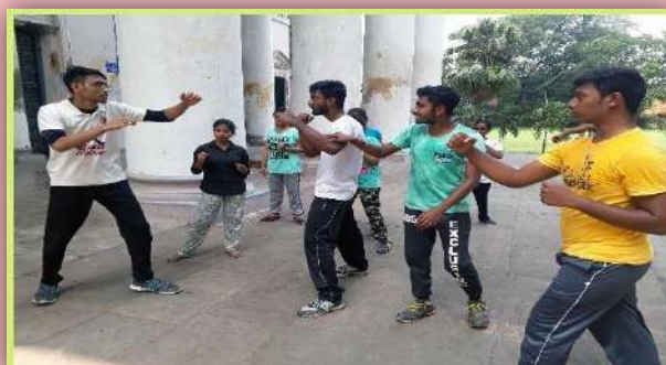
Students undergoing Self-Defence Training

Serampore College has introduced Self-defence Training Programme on 21st August, 2019. Savate Association of West Bengal conducts this Self-Defence Training Programme on every Wednesday from 9 a.m. to 10 a.m. This is a one-year course. In this unique training programme, different