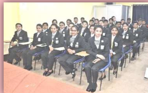
B. VOC Students in their Class Room

The Department has all modern facilities like Air Conditioned Smart Classrooms and computer laboratories for practical training. This Department organizes various kinds of seminars, webinars and workshops related to the hospitality and tourism sectors from time to time. The students get the opportunity to train and equip themselves with the necessary knowledge and