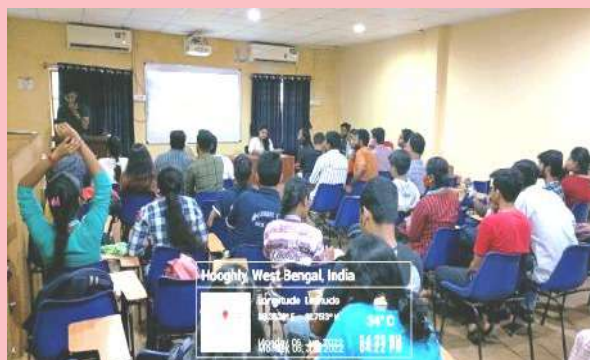
QUIZ PROGRAMME CONDUCTED BY NSS

The National Service Scheme, popularly known as NSS, was launched in the Mahatma Gandhi's Birth Centenary year in 1969 as a voluntary service programme of the students and the youths. It aimed to develop students' personality through community service. Thrust areas of NSS are social harmony and national integration, functional literacy, life skills education, women's development and gender justice, disaster management, adolescent health and development and cleanliness drive.