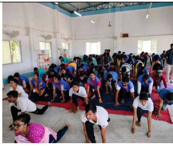
International Yoga day celebration on 21 st June, 2023