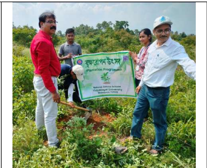
Programme on World Environment Day celebration on 5 th June, 2023.