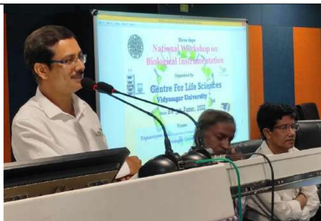
National Workshop on Biological Instrumentation in June 2022