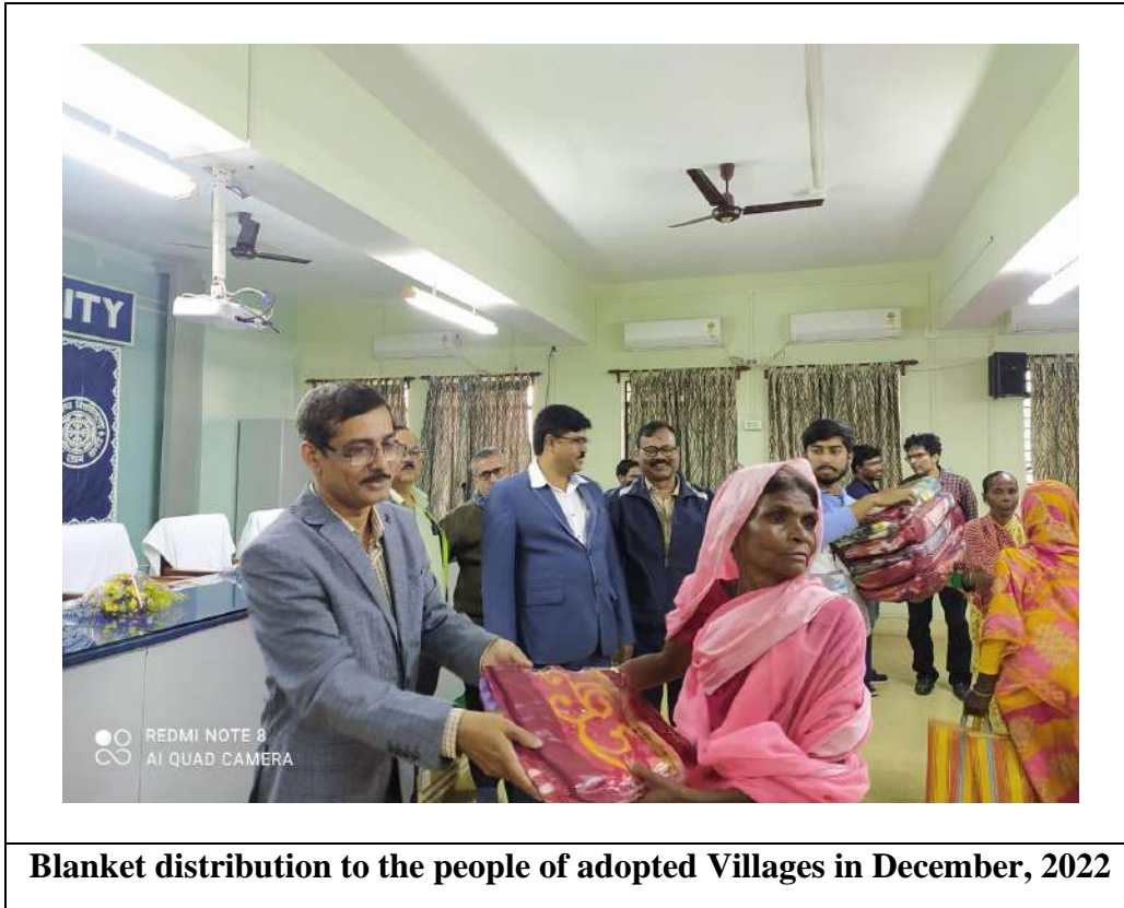
Blanket distribution to the people of adopted Villages in December, 2022