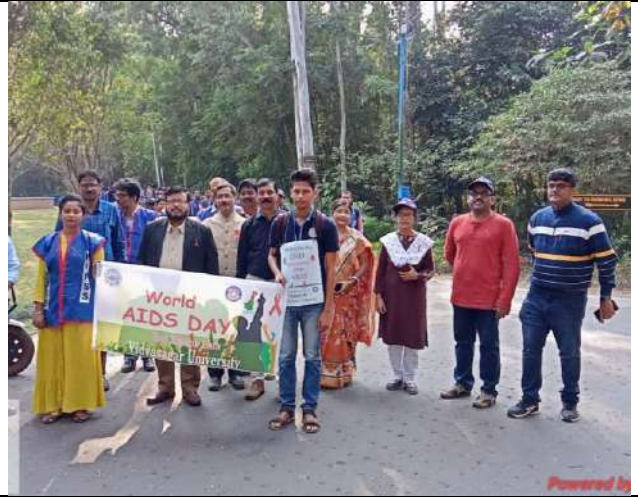
Celebration of World AIDS Day 01.12.2022