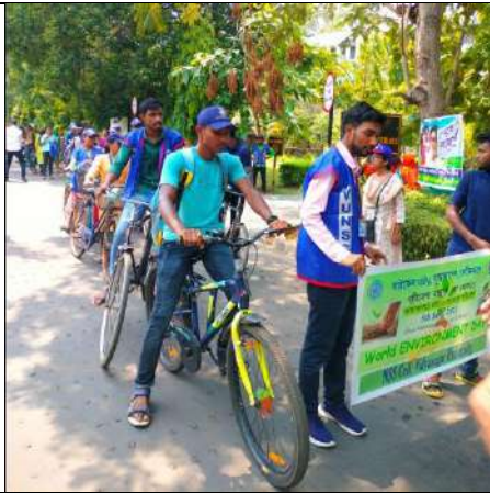
Cycle rally and Swachhata Action Plan to aware about different environmental issues