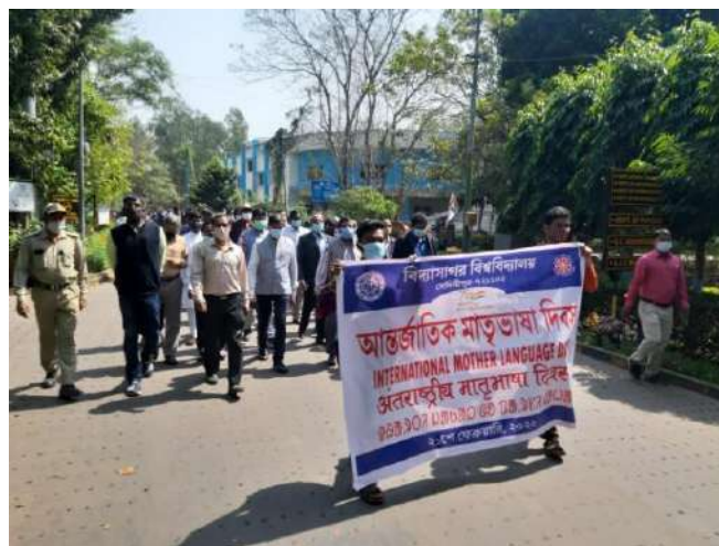
Programme on International Mother language day