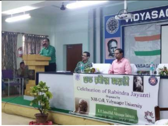
Celebration of Rabindra Jayanti, 2023