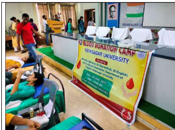
Blood donation programme