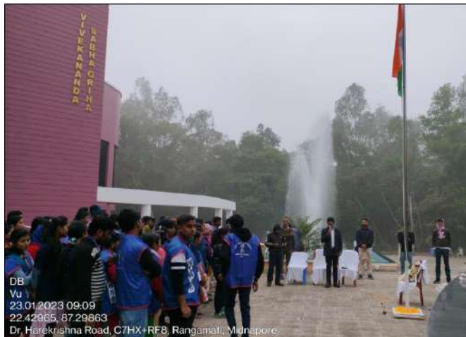
Celebration of Netaji Birth Day on 23 January, 2023