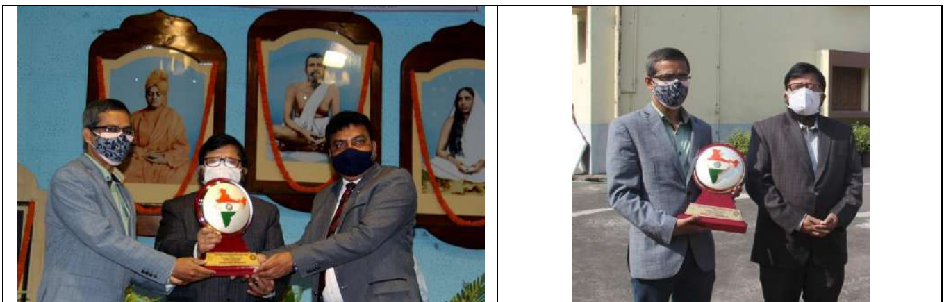
State NSS award for best activity for 2018-2019 was received by Hon'ble Vice Chancellor and Programme Coordinator on 6 th January, 2022