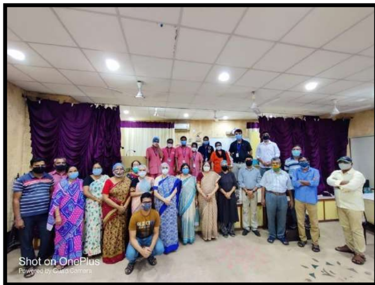
Covid – 19 vaccination drive team

27. Campus recruitment is carried out through the Placement Cell.